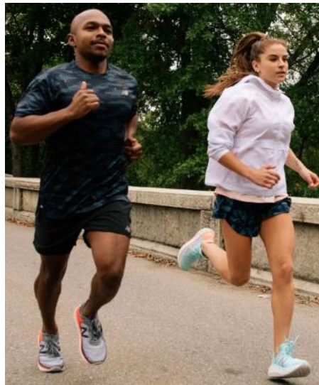
Running, walking, etc.