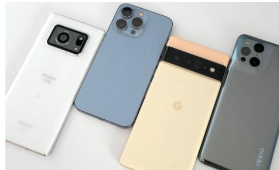
Smartphones have become indispensable for running, including music players and electronic money.